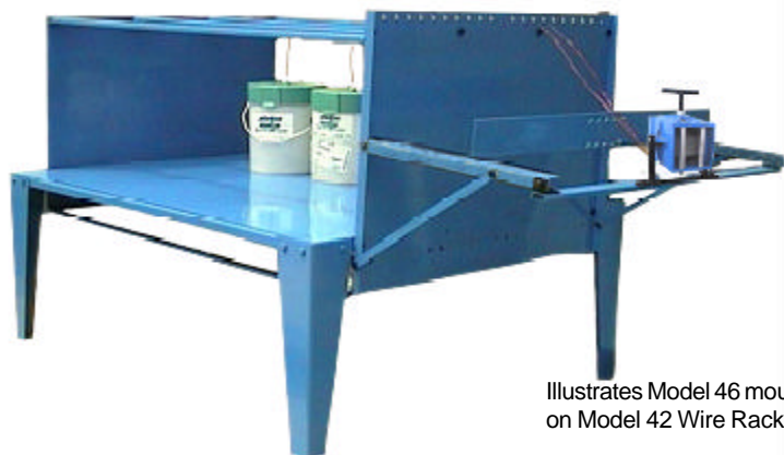
Illustrates Model 46 mounted on Model 42 Wire Rack

ace Since 1919 ACE Equipment Company 4725 Manufacturing Road Cleveland, Ohio 44135 800-255-1241*PH216-267-6366*FAX216-267-4361 email: info@armaturecoil.com www.armaturecoil.com